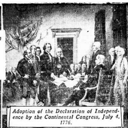
Adoption of the Declaration of Independence by the Continental Congress, July 4, 1776.