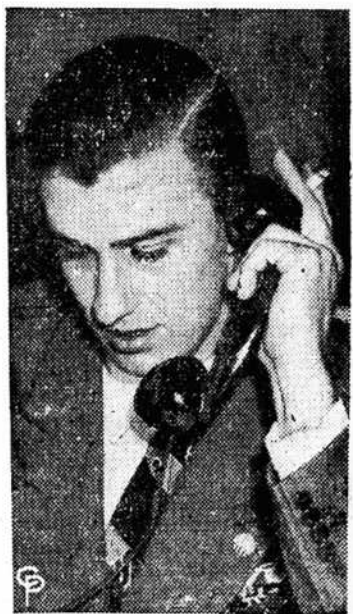
F. D. R., Jr. Franklin D. Roosevelt, Jr., third son of the President, is pictured here at work at Democratic campaign headquarters in New York. Working for re-election of his father, he is directing activities among college students. Young Roosevelt will soon become a law clerk.