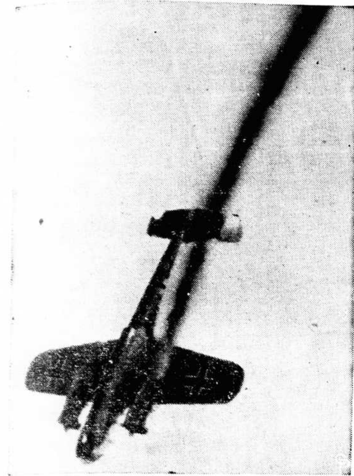
A Nazi bomber, its starboard motor aflame from a direct hit, streaks earthward during a raid over southeast England. This plane is known as the "flying pencil" because of its long tail.