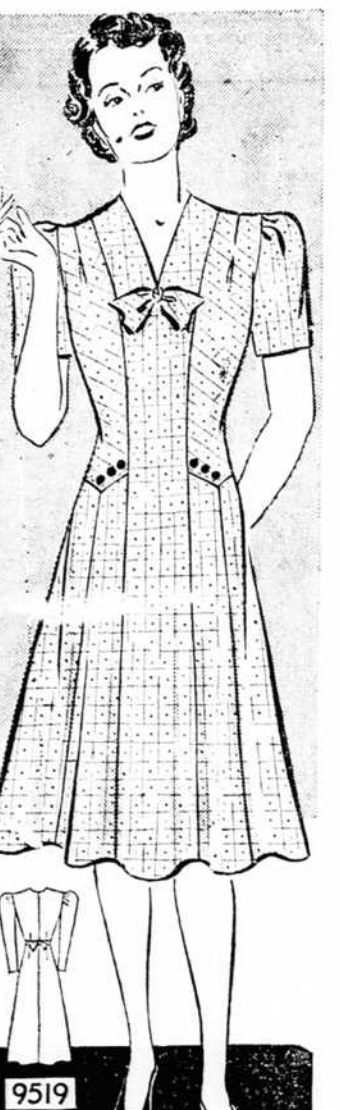
A SLIM PANELED HOUSEFROCK Marian Martin PATTERN 9519

This trim housefrock would make you feel "at home" anywhere... it's so figure-flattering. Marian Martin has planned Pattern 9519 especially for the larger-sized women, and every detail really slims. For instance, that long front panel goes all the way from shoulders to hem in a flowing, unbroken line. And the bias-cut side bodice sections are made in low points for a slender long-waisted effect. Notice the double skirt panels at each side-front—they give becoming lines and extra ease through the skirt. The whole back of the frock is in just two simple pieces. Make this long or short-sleeved style in a jiffy with the Sew Chart for aid. Pattern 9519 may be ordered only in women's sizes 34, 36, 38, 40, 42, 44, 46, 48 and 50. Size 36 requires 4 yards 39 inch material. Send fifteen cents in coins for each Marian Martin pattern. Thirty cents (30c) for both. Be sure to write plainly your size, name, address, and style number. Send your order to Henderson Daily Dispatch, Pattern Department, 232 W. 18th Street, New York, N. Y.