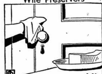
A damp cloth dipped in whitening rubbed gently over finger-smear places on the paint around door handles will remove the soil without making the paint thin. Rinse with clear water and dry.