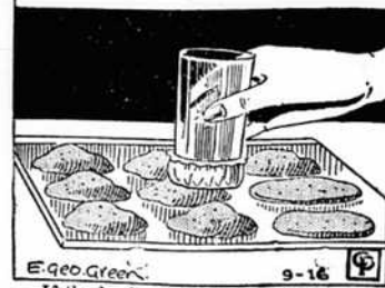
If the back of your spoon sticks when you flatten drop cookies with it, take a small oiled silk cover used to cover food in the refrigerator, slip it over the bottom of a water glass, dampen it and press the cookies flat with it.