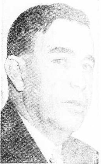
Sen. Dennis Chavez