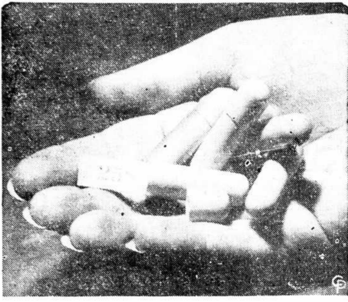
These are actual samples of the capsules to be used at the national draft lottery to be held in Washington, D. C., a week or so after the draft registration. Number 258, the number photographed, was the first number drawn during the 1917 lottery. Numbers are printed on white cardboard and inserted inside the capsules.