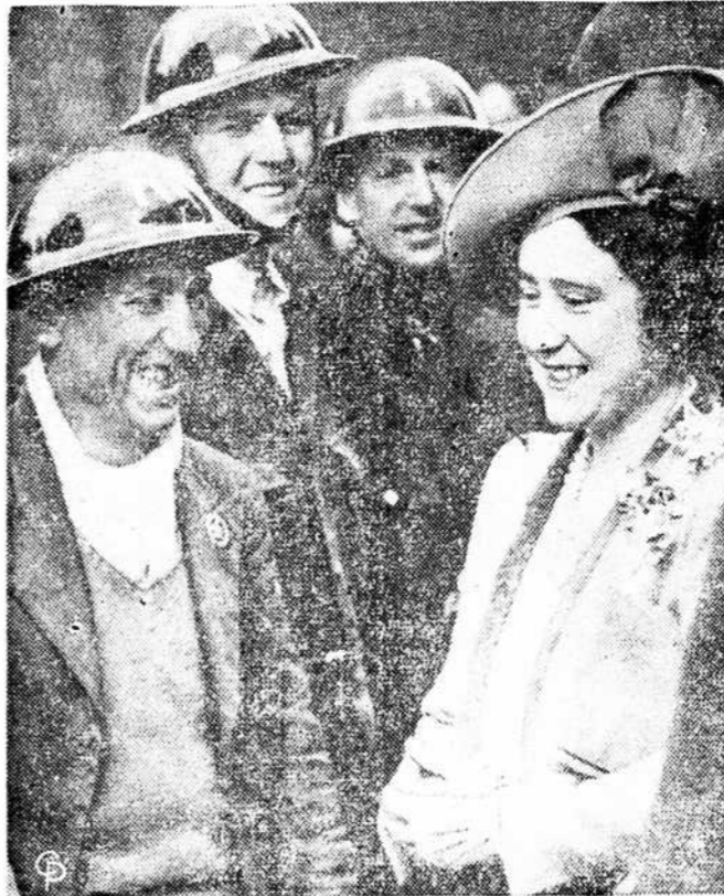
Queen Elizabeth shares a joke with Air Raid Precautions workers as the beloved ruler makes a tour of West London to inspect air raid damage. Hitler's aerial blitzkrieg doesn't seem to have had much effect on the morale of this group.