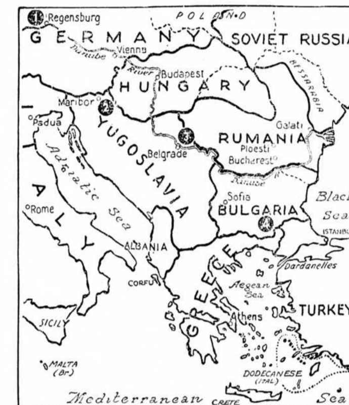
German troop movements through the Balkans have precipitated a crisis which may spread the war all the way to Asia Minor. Embarking at Regensburg (1) Nazi forces are reported making their way down the Danube to Rumania. Two trainloads of military supplies have been observed passing through Maribor (2). Half a dozen troopships have been reported moving past Belgrade (3). At the same time, the German radio carried a report Bulgaria was strengthening her forces on the Greek and Turkish frontiers (4).