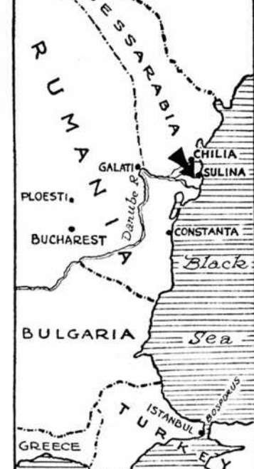
Russian troops are reported to have penetrated German-dominated Rumania, crossed the border at Chilia and advanced as far south as Sulina (arrow). Increasing Red-Nazi friction is seen in the Soviet's announcement it had not received satisfactory advance information of Germany's troop movements into Rumania. Russia reportedly has promised Turkey "moral support" in resisting Axis pressure.