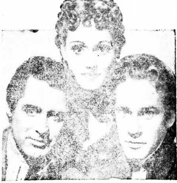
Cary Grant and Martha Scott in "The Howards of Virginia," playing at the Embassy Monday, Tuesday and Wednesday.