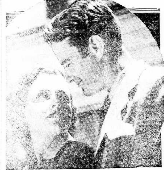
Dr. Kildare and Laraine Day in "Dr. Kildare Goes Home," playing at the Stevenson Monday, Tuesday and Wednesday.