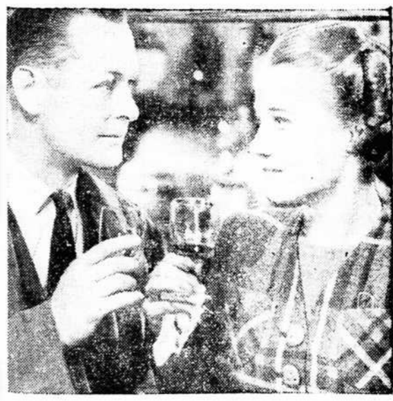
A scene from "Haunted Honeymoon," playing at the Stevenson Monday, Tuesday and Wednesday.