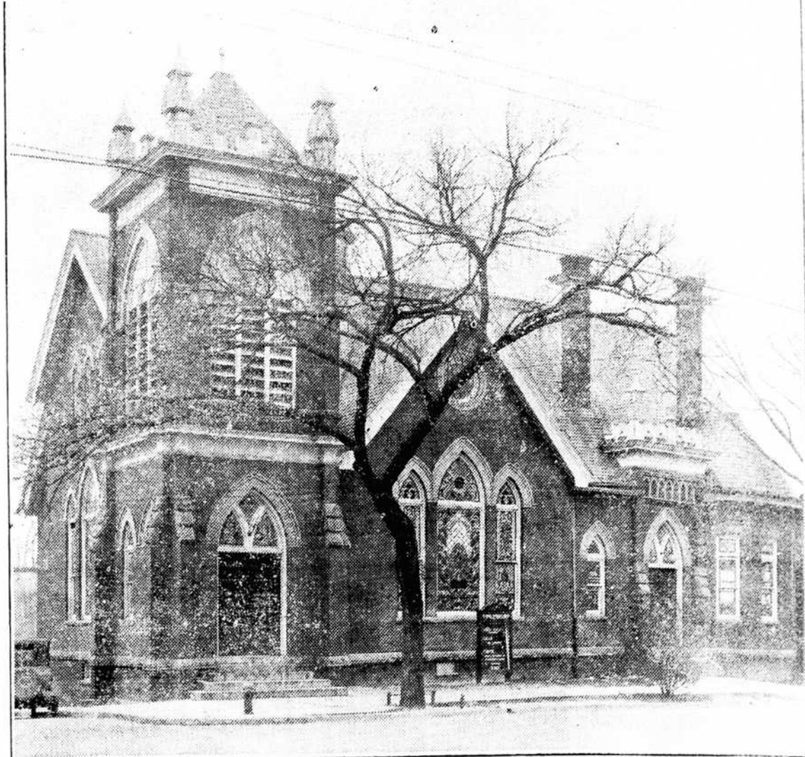
CHRIST METHODIST CHURCH