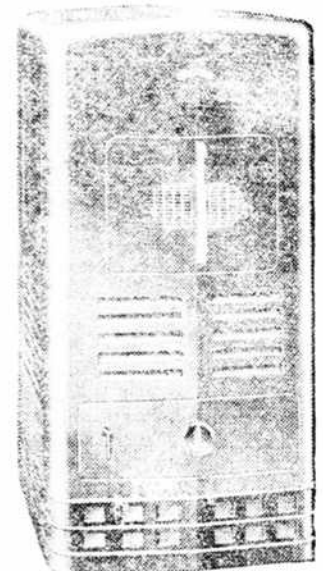
Model illustrated is the 600 Series; made in three sizes.

IT'S the famous, exclusive Ingersoll-Fire Air Duct. Built right in the path of the flames, it prevents heat losses up the flue—sends the warmth into the rooms. This is just one of the genuine Estate Heatrola's many advantages—exclusive features which keep the temperature up, the fuel bill down. Come in; see our special Heatrola display.