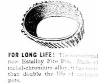
FOR LONG LIFE! The sensational new Estalloy Fire Pot. Made of nickel-chromium alloy, it has more than double the life of cast-iron pots.