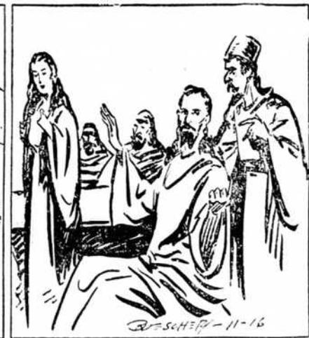
The Pharisee was shocked, but Jesus rebuked him saying that he had not performed the rites of welcome, but the woman had. To the woman He said: "Thy faith hath saved thee; go in peace." (GOLDEN TEXT-John 10:10)