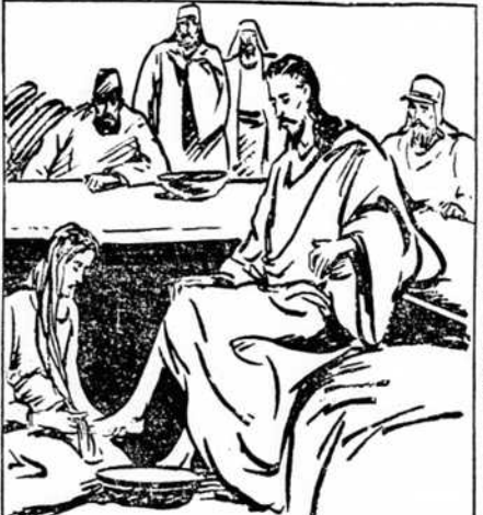
A Pharisee asked Jesus to dine with him, and when they were eating, a sinful woman came to Him Weeping, she washed His feet with her cears, dried them with her hair, and anointed them with precious ointment.