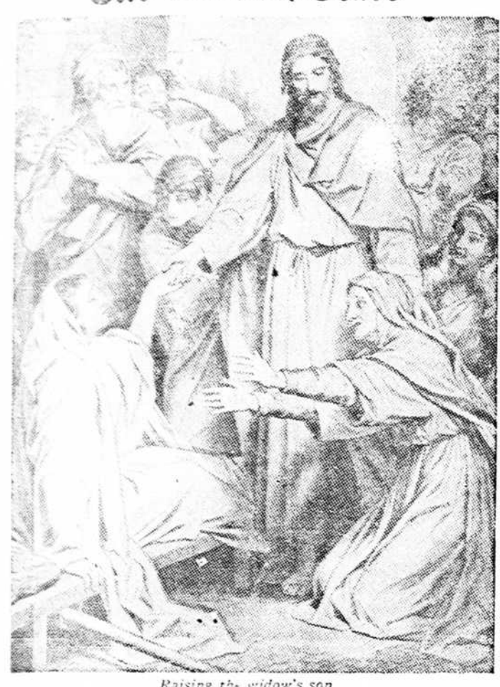
Raising the widow's son "t came that they may have life, and may have it abundantly."---