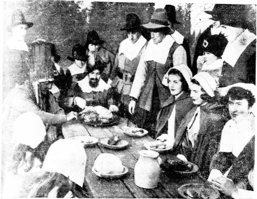
Local residents of Plymouth, Mass., gather around the festive board while Captain Miles Standish (left) carves the turkey as the birthplace of Thanksgiving. Day re-enacts a preview of the original Thanksgiving at the birthplace of Thanksgiving, Plymouth, Mass., on November 23 with pageantry which will include this scene.