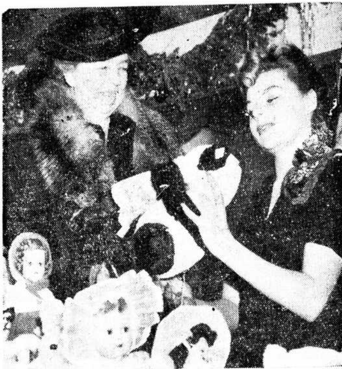
Mrs. Franklin D. Roosevelt sets an example to the women of the nation by doing her Christmas shopping early. She is pictured in a Fifth Avenue shop, in New York, selecting toys for her grandchildren.