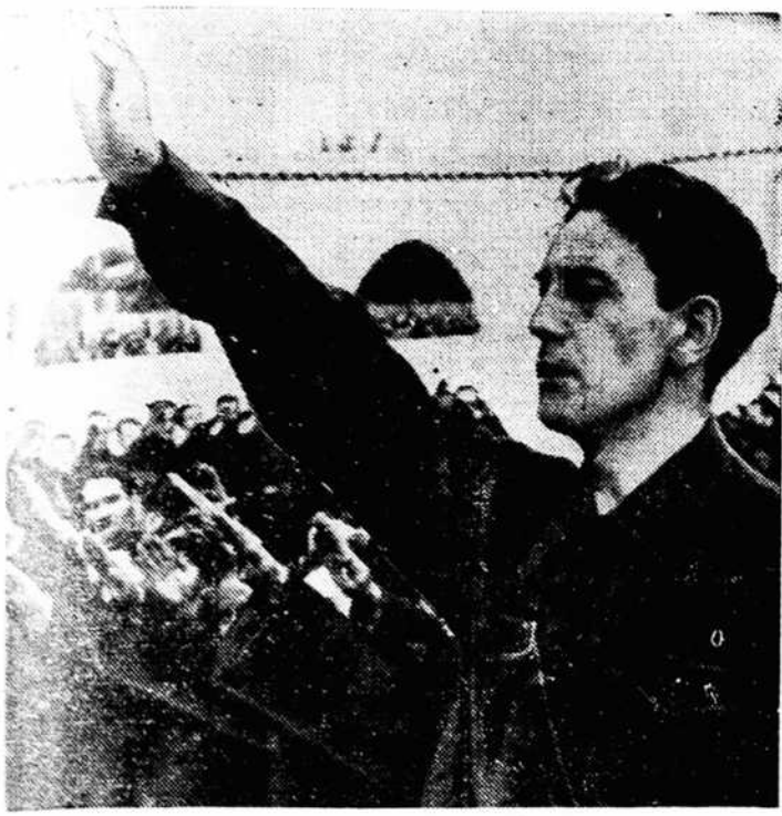
Premier Horia Sima, leader of the pro-Nazi Iron Guard, shown disavowing his followers in Bucharest, has disavowed responsibility for the massacre in which at least 64 leading Rumanians met violent death. The killings were in retaliation for the slaying of Iron Guard leader Corneliu Z. Codreanu two years ago.