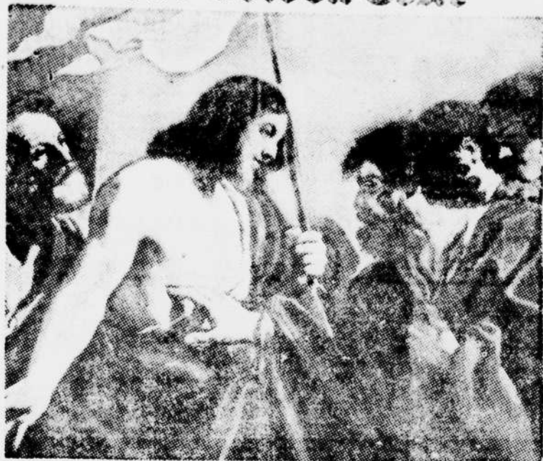
Thomas the Doubter

"Behold, I send forth the promise of My Father upon you."— Luke 24:49.