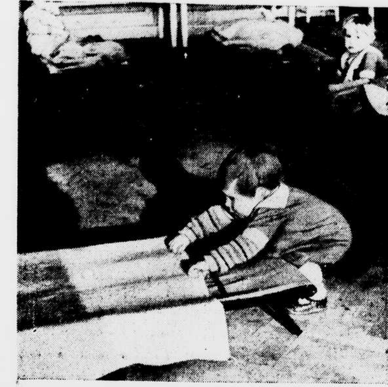
An important problem arising out of the necessity for British women engaging in the various services is being solved through use of creches and day nurseries. Children are given scientific care at 25 cents a day, of which the state pays one quarter. Here, a child, hardly more than an infant, makes his own bed.