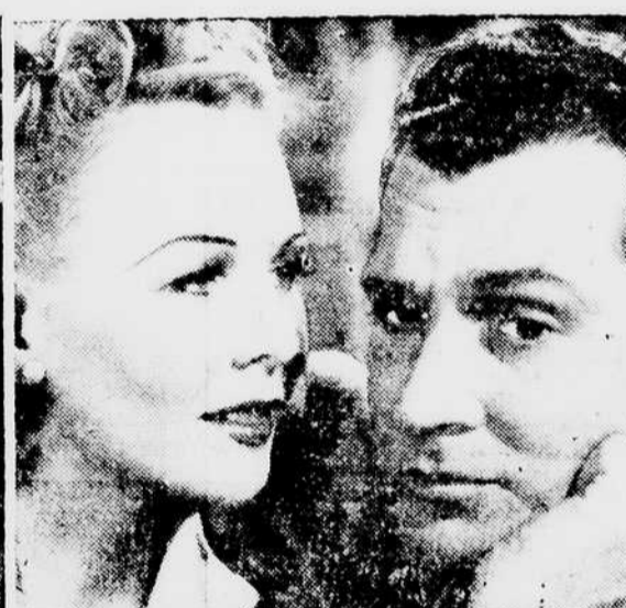
Wendy Barrie, Kent Taylor in "Repent At Leisure"—Stevenson Thursday only.