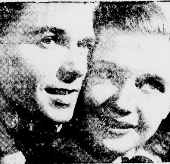
Priscilla Lane, Ronald Reagan in "Million Dollar Baby"—Embassy Wednesday only.