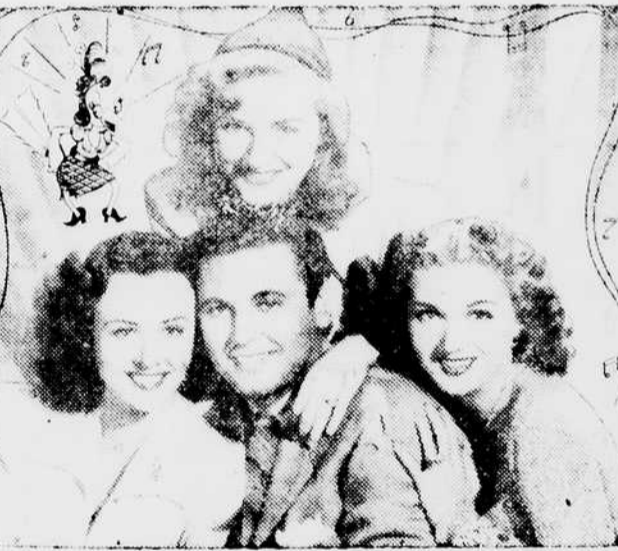
Allen Jones, Margaret Lindsay in "There's Magic in Music"—Stevenson Monday and Tuesday.