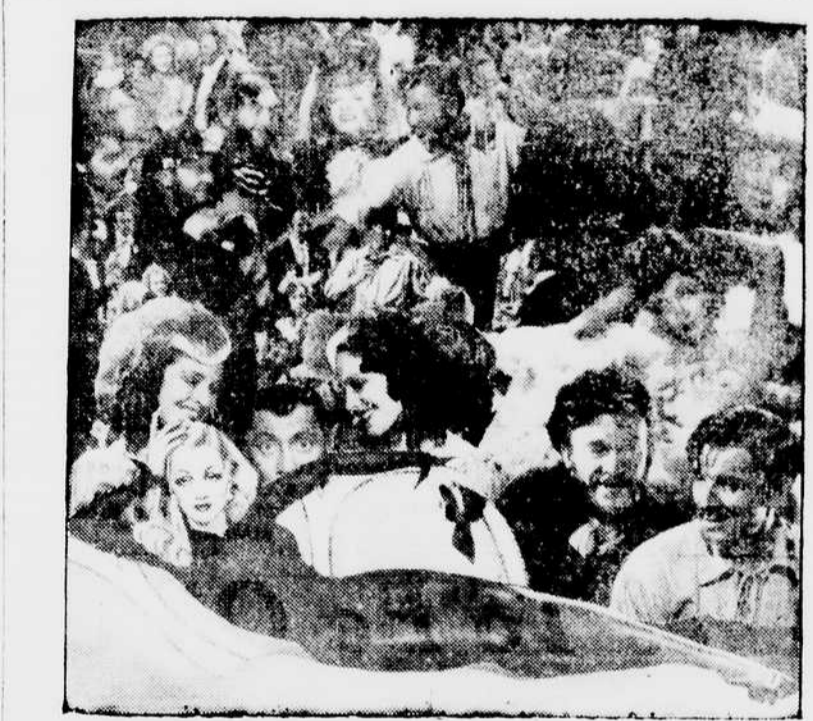
Marlene Dietrich in "The Flame of New Orleans"—Embassy, Starts Thursday.

Official sanitary inspection before the exportation of hides and skins has been required by the government in Paraguay.