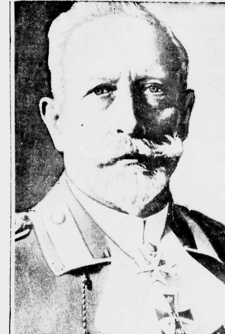
Former Kaiser Wilhelm II of Imperial Germany died at 11:30 a. m. today, it was announced officially in Berlin. Full military funeral honors will be paid, by order of Adolf Hitler, next Monday at Doorn.