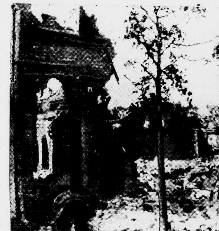
Only heaps of rubble and a few battered walls remain in this Russian town near the German border after an attack by Nazi dive bombers and tanks, according to the official German caption with this radio photo from Berlin. According to the Nazis, the building at left is what remains of a Red snipers' nest.