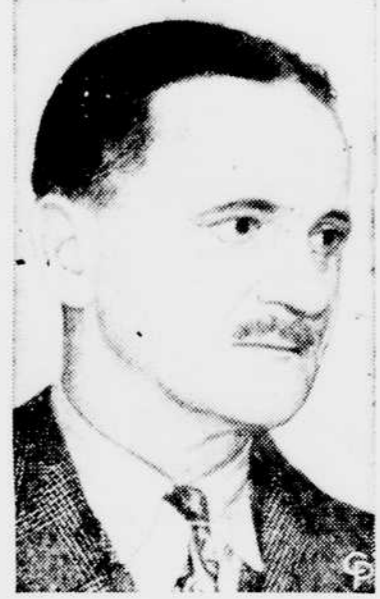
Brig. Gen. Carl Spaatz

Brig. Gen. Carl Spaatz, appointed chief of the air staff of the newly established "Headquarters of the Army Air Forces," is directly under command of Maj. Gen. Henry H. Arnold, who becomes chief of the air forces. From now on, Maj. Gen. Arnold's department is an independent unit within the war department, accountable only to the chief of staff.