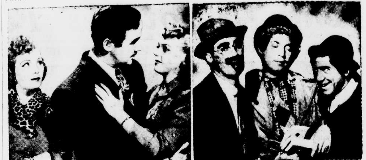
A scene from "Shining Victory"—Embassy Wednesday only.