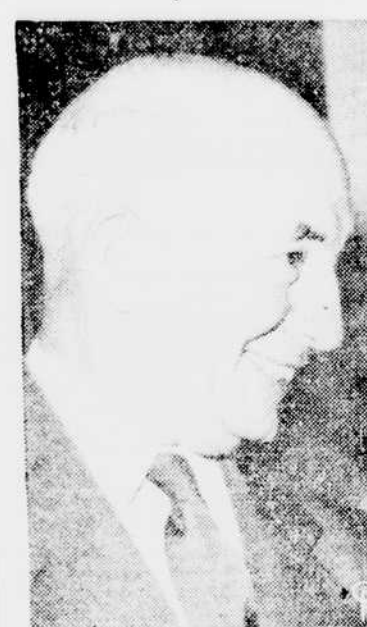
Judge Alva M. Lumpkin

Judge Alva M. Lumpkin took oath of office in Washington as junior senator from South Carolina to serve until a successor is chosen at a special election. He succeeds James F. Byrnes, who was appointed to the Supreme Court.