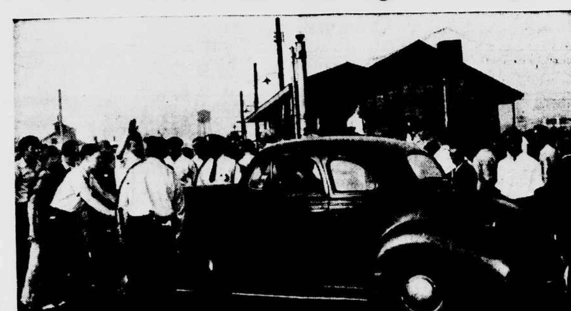
One picket holds up his hand while others surround car of man seeking to drive into the Federal Shipbuild-ing Yard at Kearny, N. J. Walkout of 16,000 CIO men brought halt to work on two cruisers and six de-stroyers. Direct government intervention was threatened when negotiations stalled.