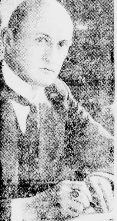
Dr. Philippe Etter, the Swiss Federal Council elected Dr. Philippe Etter, 59, president of Switzerland, succeeding Ulrich Wehrli. The new president has five sons and five daughters.