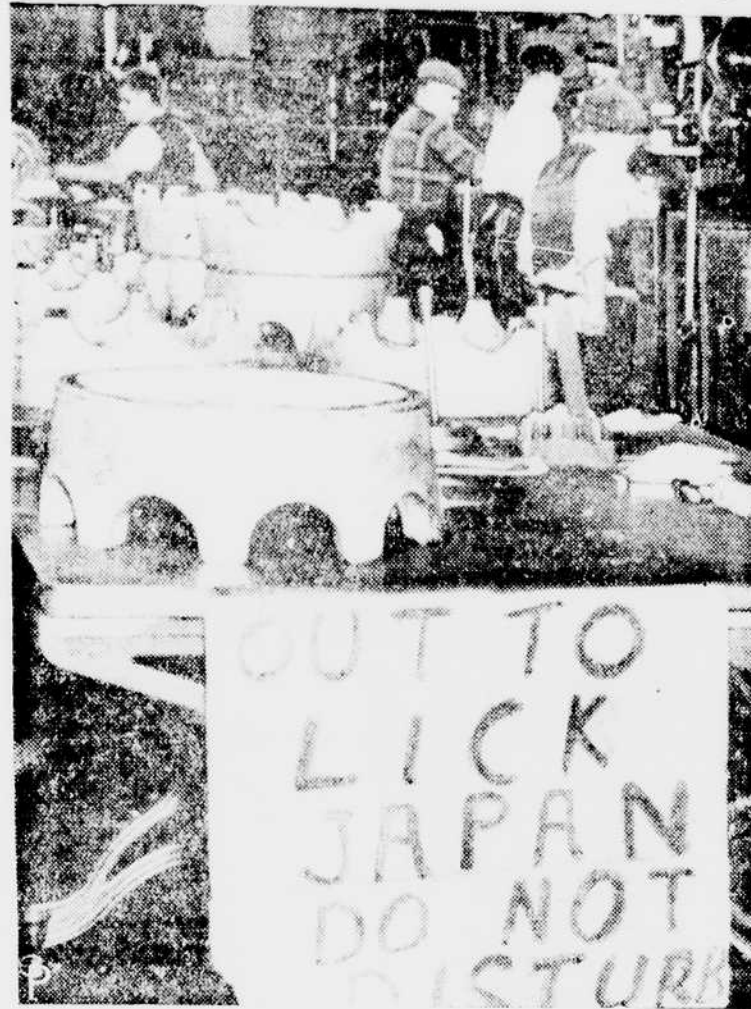
This warning sign posted by workers in the Ford Motor Company plant in Detroit saying "Out to lick Japan, do not disturb" conveys spirit of workers engaged in war effort. Plant manufactures airplane engines.