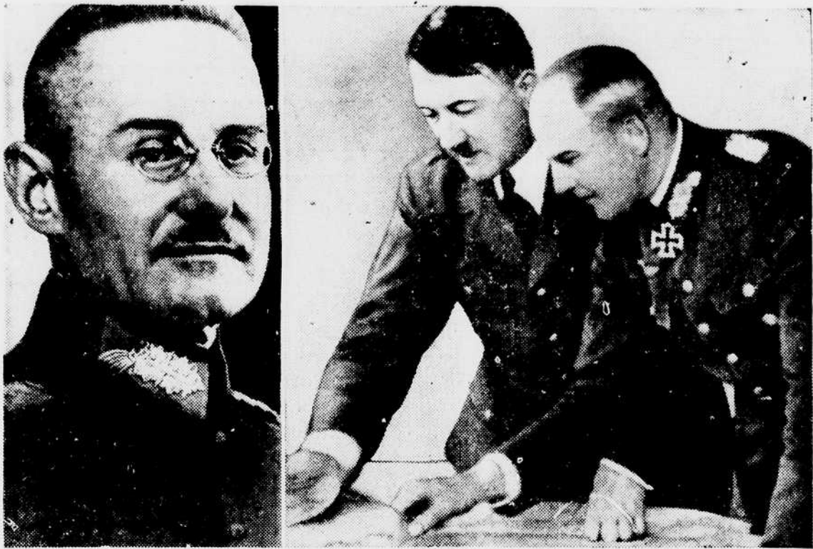
Here is the triumvirate reported in command of the Nazi war machine. Right, Hitler, who has put himself in control of the army, is shown with Gen. Alfred Jodl, usually seen in pictures with Hitler at the front, and who is credited with doing much of the strategic thinking. Left, is Col. Gen. Franz Halder, chief of the German general staff, and also credited with master-minding many of the major Nazi campaigns.