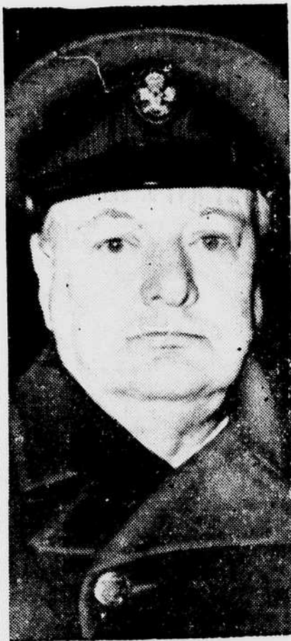
Prime Minister Winston Churchill, shown above as he arrived in Washington for historic conference with President Roosevelt, today told the Senate the allies will give the axis powers a "lesson which they and world will never forget."