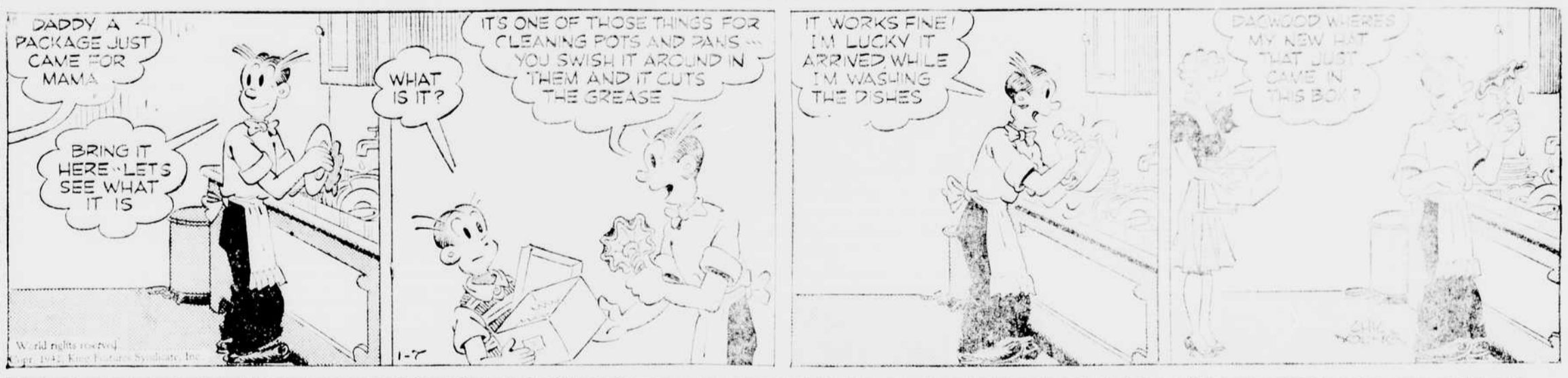
In Hot Water Again!