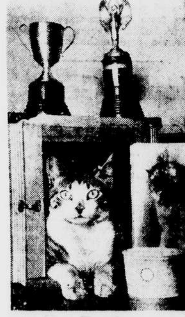
Meet Strato Lizzie, Jr., orphan kitten chosen to replace the original Strato Lizzie as mascot of the TWA airlines pilots. She was selected for her remarkable resemblance to her celebrated predecessor! Here the new Lizzie is making herself right at home in her namesake's traveling case.