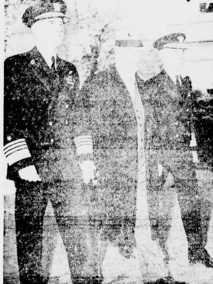
The big three of the U. S. Navy are shown on their way to confer with President Roosevelt on the Far East situation. Left to right, are Admiral Ernest J. King, commander of the U. S. fleet, who has been placed in full charge of the navy, under Ernie; Secretary Knox, and Admiral Thomas C. Hart, retired commander of the United States naval forces in the Far East.