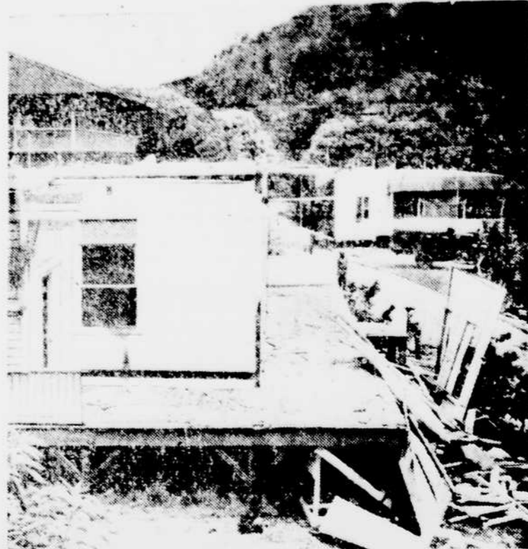
Wreckers in the Panama Canal Zone raze a frame dwelling as an entire residential area is cleared away. Object is to remove everything that could be set afire by enemy incendiary bombs or enemy agents and become beacon flares to guide enemy bombers.