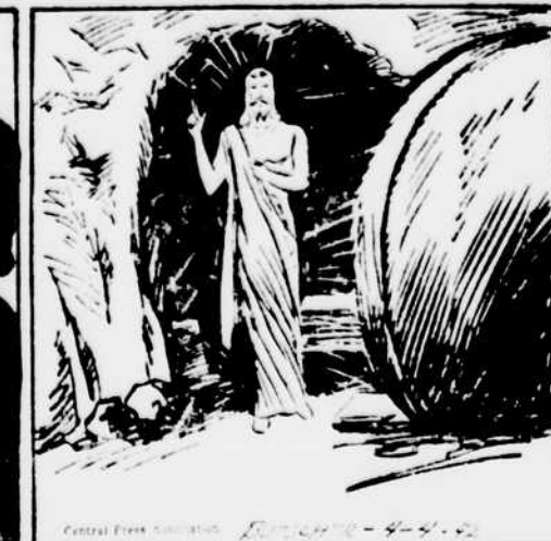
Then shall be brought to pass the saying. Death is swallowed up in victory O death, where is thy sting? O grave, where is thy victory? (GOLDEN TEXT-1 Cor 15 57)