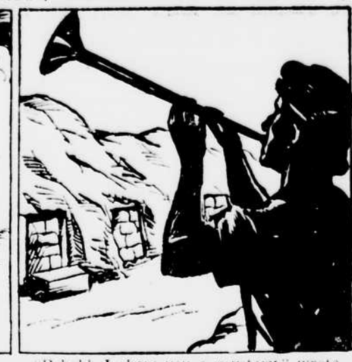
Behold, I show you a mystery," wrote Paul to the Corinthians We shall all be changed for the trumpet shall sound, and the dead shall be raised incorrupttble and we shall be changed.