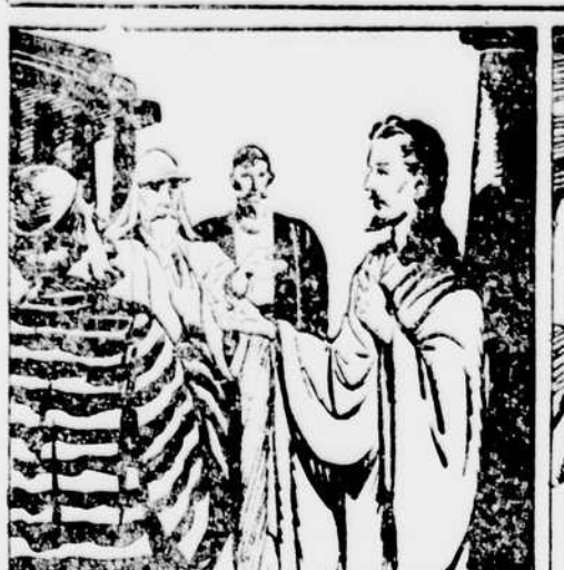
after death would be a woman who had