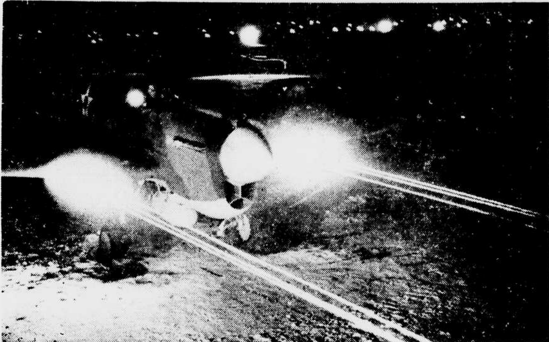
Mounted in flying position, a Curtiss Hawk P-40E, more commonly known as a Kittyhawk, is publicly demonstrated for the first time at Buffalo, N. Y. It is shown on the firing range with its propeller going and machine guns firing rapidly. Those lines of light are caused by tracer bullets by which the pilot can tell whether his shots are reaching their targets.