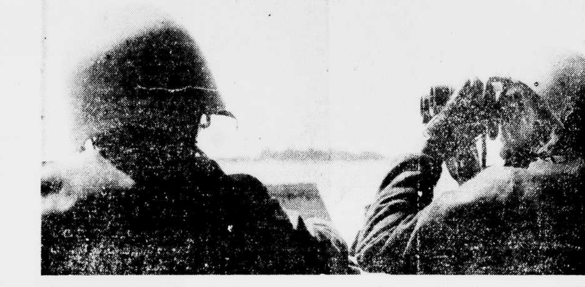
One of the biggest ships in an Atlantic convoy (top) is seen hazily through an early morning mist as it ploughed towards one of our far-flung battle zones carrying the sinews of war. Keeping watch over the ship is a Navy blimp. Two fire control men are shown at their post aboard an escorting warship (bottom).