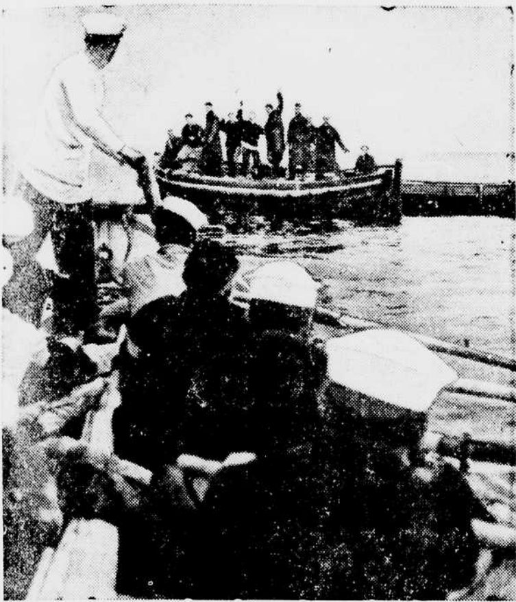
A glad sight for searching eyes was this Coast Guard surfboat as it pulled close to a lifeboat containing survivors from a torpedoed ship in the Atlantic. While the men were being picked up, a patrol vessel, which had spotted the survivors first, went on an immediate hunt for the enemy sub.