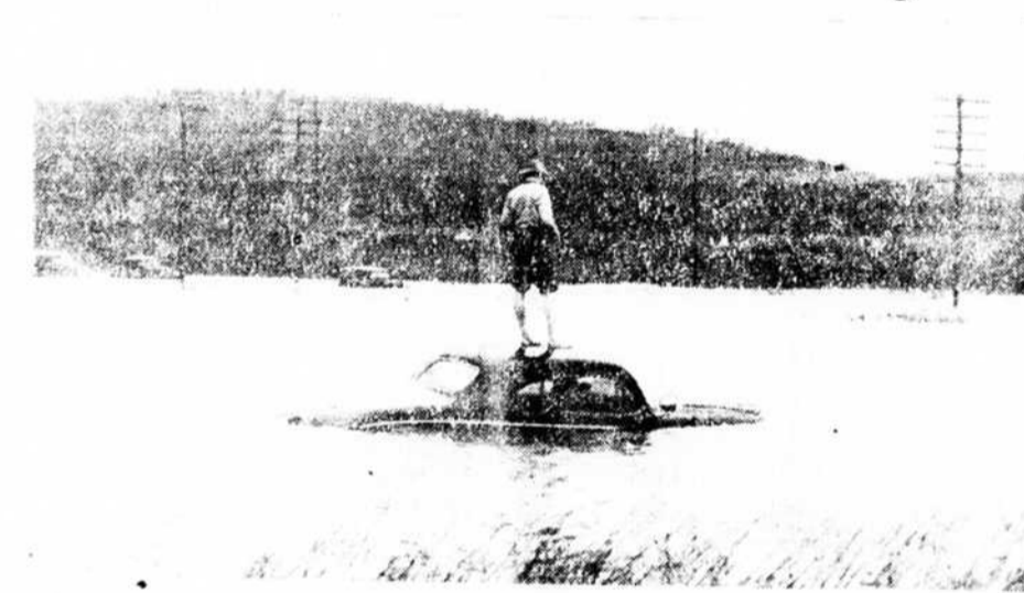
Standing atop his submerged car, this motorist thinks wistfully of the recent day when his only problem was fuel rationing. The photo was taken on the outskirts of Birmingham, Ala., where the heaviest rains to fall in 26 years flooded numerous areas in the city.