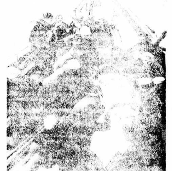
U. S. Coast Guard men are shown here ferrying a survivor of a torpedoed British merchant ship aboard a rescue cutter, somewhere in the North Atlantic. The person taken aboard in stretcher was one of survivors picked up from a whale boat. This is an official U. S. Coast Guard photo. (Central Press)