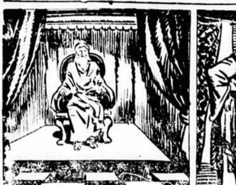
There was a man of the Pharisees whose name was Nicodemus, and he was a ruler of the Jews.