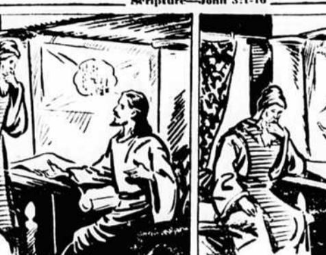
Nicodemus told Jesus that he knew Jesus was a teacher come from God because of the miracles He performed.