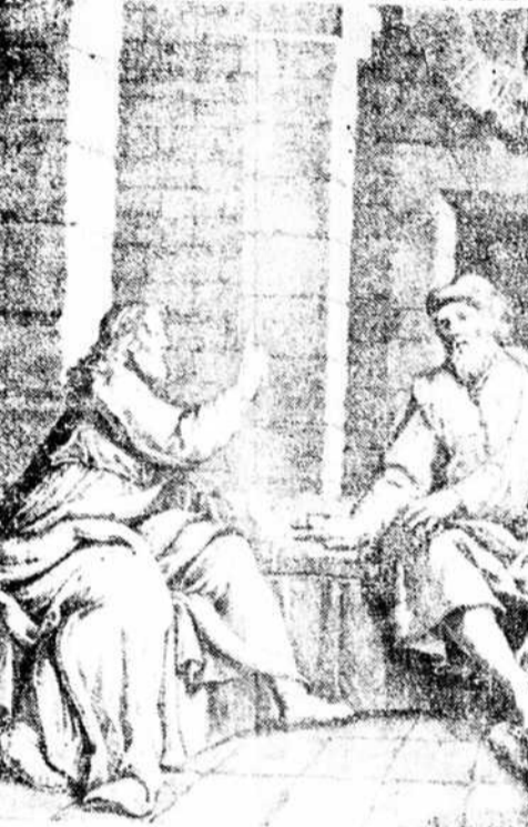
Nicodemus' visit to Jesus

"For God so loved the world, that He gave His only begotten Son, that whosoever believeth on Him should not perish, but have eternal life."—John 3:16.