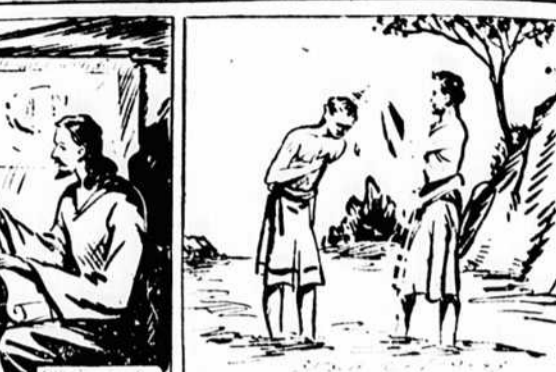
Jesus said to Nicodemus, Verily, verily, except a man be born again, he cannot see the kingdom of God.