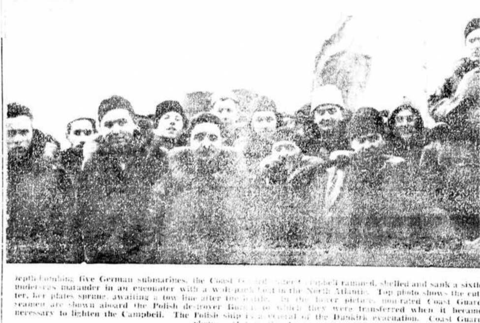
Depth-charging five German submarines, the Coast Guard cutter Campbell rammed, shelled and sank a sixth undersea raider in an encounter with a wolf pack in the North Atlantic. Top photo shows the cutter, her plates sprung a tow line after the battle. In the lower picture, crew members are shown aboard the Polish destroyer Grom, to which they were transferred when it became necessary to lighten the Campbell. The Polish ship is a remnant of the Dunkirk evacuation. (After Atlanta)