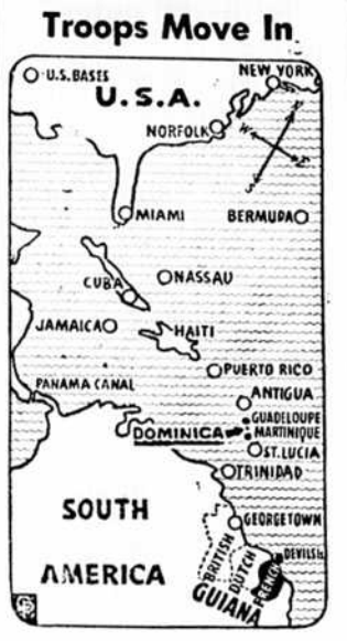
A TROOP DETACHMENT from Barbados, according to a British radio announcement, has embarked for Dominica Island (arrow), a British possession that lies between Guadeloupe and Martinique in the West Indies. The German radio reported that U. S. naval units were moving on Martinique. U. S. and British officials would not comment.