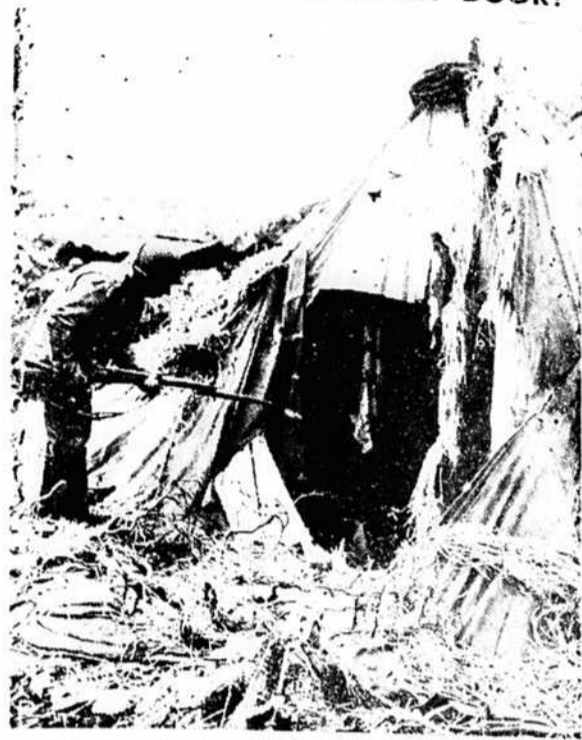
"NOBODY HERE BUT US SEALS," probably is the answer received by this American soldier as he cautiously invades a Japanese bayonet at ready, he is seeking snipers in the mopping-up action just completed by our troops on the Aleutian island.