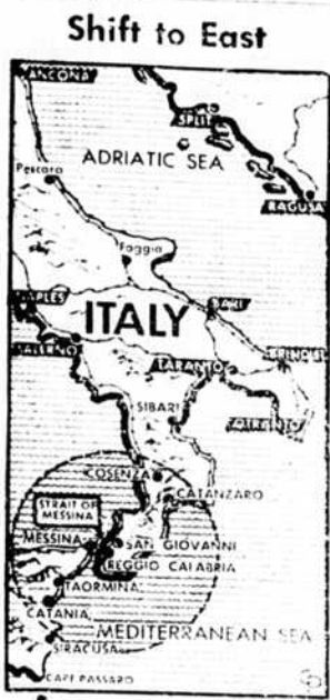
SHIFTING THE TARGET from the Adriatic to the Mediterranean Sea is the strategy of the Allies. The map shows the shift from the Adriatic to the Mediterranean Sea. The Allies are now attacking the Italian coast, the Mediterranean Sea, and the Italian coast. The Allies are now attacking the Italian coast, the Mediterranean Sea, and the Italian coast.

Communications said the heavy bombers from the Middle East command swept across the Mediterranean to attack the enemy airbase at Comiso in Sicily on Tuesday night while twin-engine Wellingtons from northwest Africa targeted Olbia in northern Sardinia.