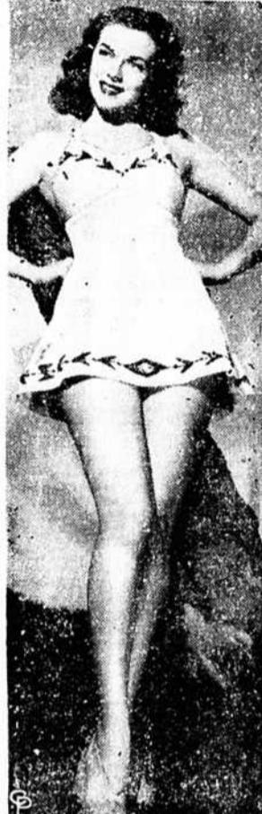
PRETTY Marguerite Chapman, film player, has been chosen by the men of Henderson Army Air Field, Austin, Tex., as "The Girl With Whom We'd Like to Keep An Appointment In Berlin." Of course that's after they dispose of a certain man there.