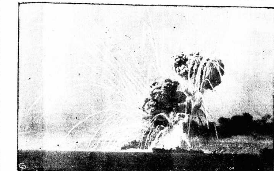
An alert Coast Guard cameraman took this spectacular picture at the moment a United Nations vessel blew sky high after Axis planes bombed it during the initial stages of the invasion of Sicily. Censors have just released the information that only six vessels were lost in the large-scale invasion.