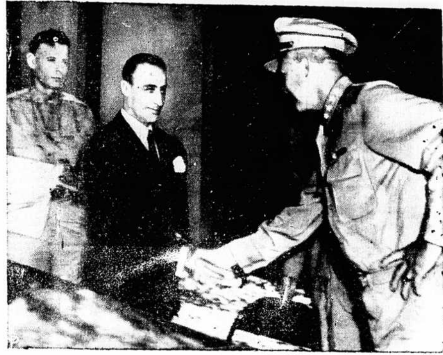
This picture was taken a few moments after the signing of the military armistice between Italy and the Allies. The signing took place on Sept. 3 at Allied headquarters in Sicily.