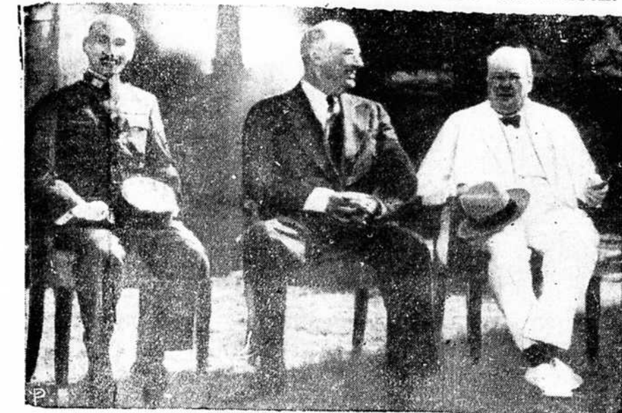
Taking time out at Cairo, Egypt, from their history-making conference on the war against Japan, the three leaders sit in the sunlight—President Chiang Kai-shek of China, President Roosevelt and Prime Minister Churchill.