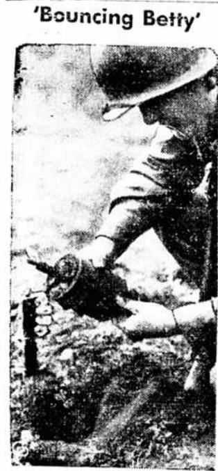
'Bouncing Betty' A. U. S. PARATROOPER examines a German S-type pressure mine, known to Yanks as "Bouncing Betty," after digging it up near Venafro, Italy.