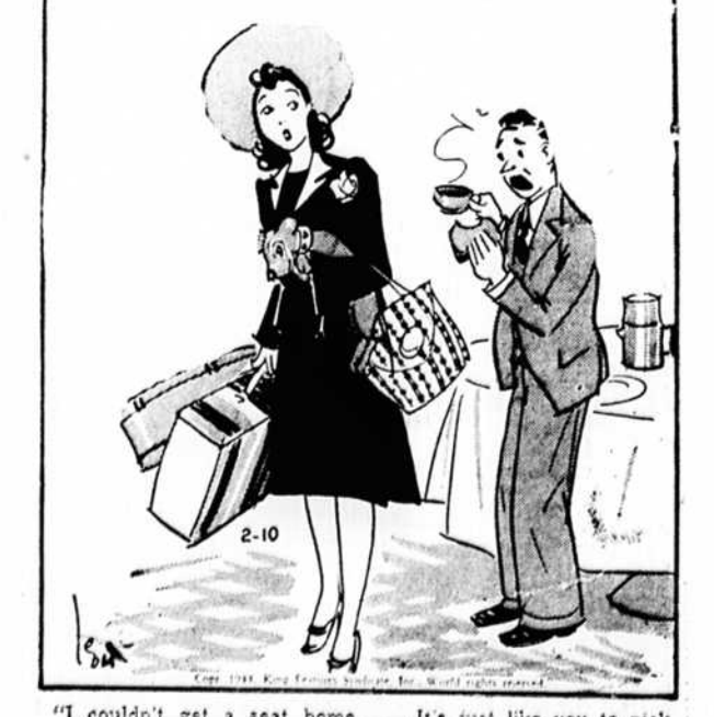
"I couldn't get a seat home. It's just like you to pick an argument when the trains are crowded."