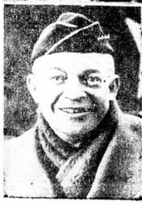
Invasion commander Gen. Dwight Eisenhower is caught by the camera in varying moments as he concentrates on the work of his tank crews during a practice session somewhere in England.