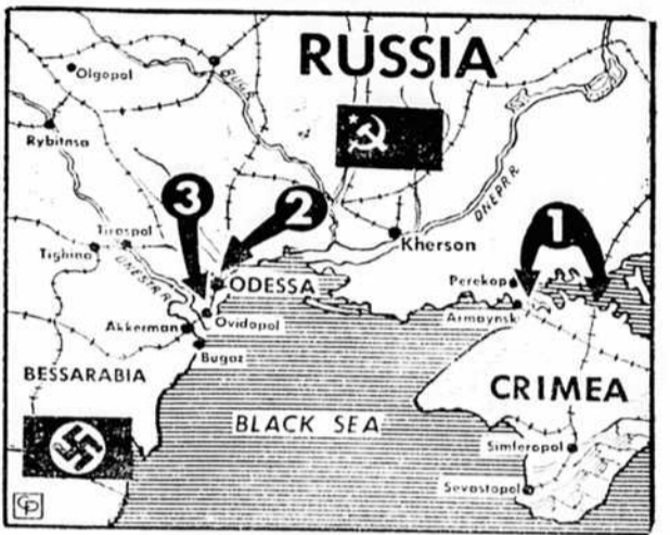
TWO RED DRIVES on the Crimea (1), part of an effort to clear all south Russia of Axis invaders, were reported today. The first drive, for Sevastopol (2 and 3) where an effort is being made to halt the flight of Axis troops, is being followed by the Red Fourth Army in a two-pronged drive to the south of Odessa and with a two-pronged drive to the south of Odessa.