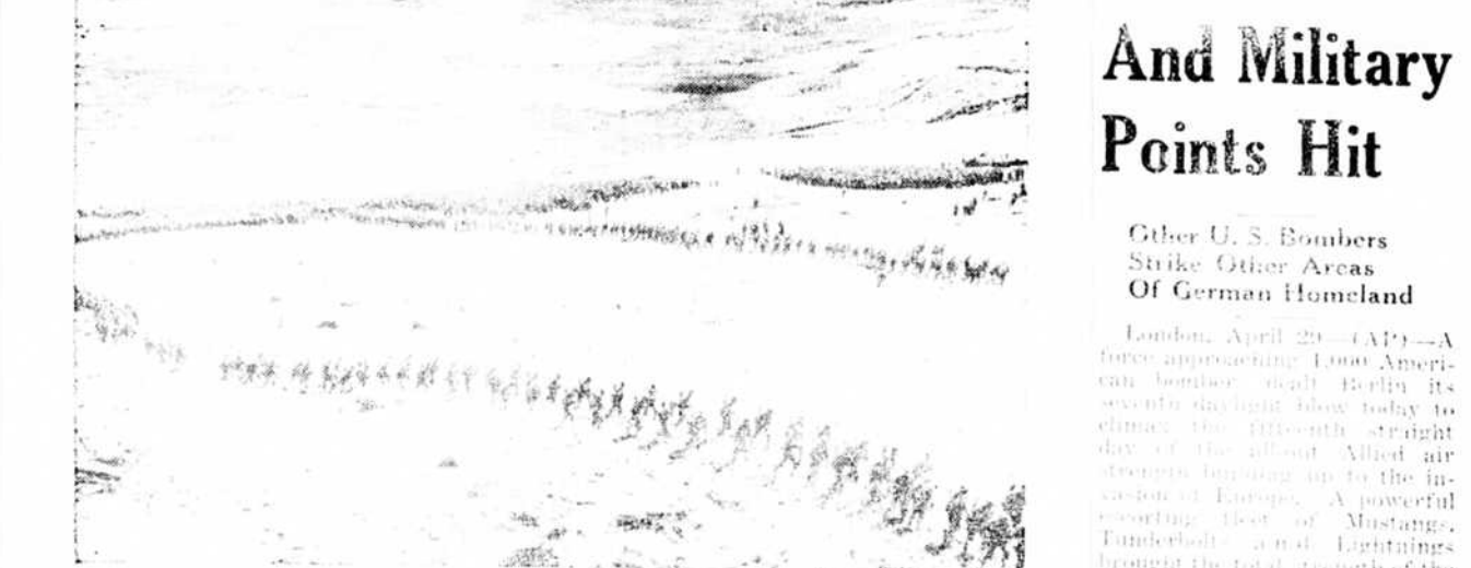
WEARING FULL PACKS, hundreds of American troops are seen here in their camp after exhaustive pre-invasion maneuvers in the rugged English country. The first wave of the invasion is expected to be launched in the next few days. A number of troops are seen here in their camp after exhaustive pre-invasion maneuvers in the rugged English country.

YANKS TOUGHEN UP FOR INVASION ON ENGLISH MOORS