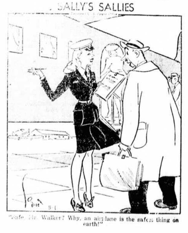
"Safe, Mr. Walker? Why, an airplane is the safest thing on earth!"

Wanted ads section with various listings and notices.