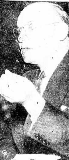
Rep. Emanuel Celler

UNLESS enlistments in the Women's Army Corps increase heavily, Rep. Emanuel Celler of New York will introduce in Congress, before June 1 a bill to draft into military service unmarried women between the ages of 21 and 31 who are not fully employed.